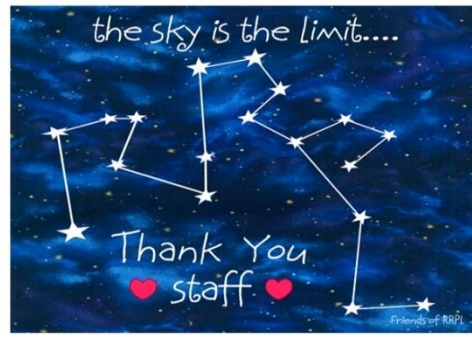
Staff Appreciation sign