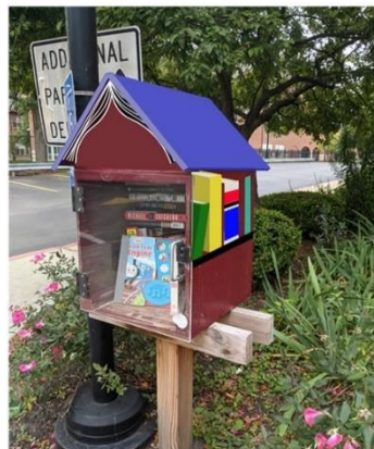
Book Box Refresh (in process)