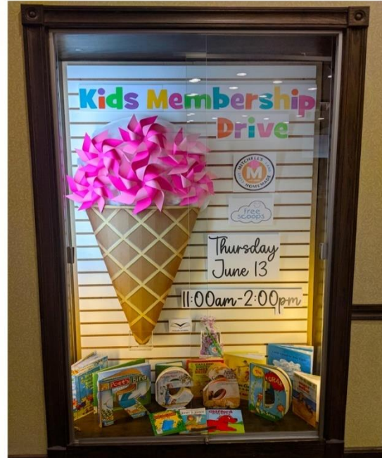
Lobby Display Case