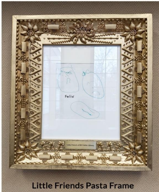
Little Friends Pasta Frame